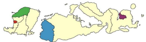
Figure 3. Map of Cities/Regencies in NTB Based on People's Welfare Indicators

into cluster 1, namely West Lombok, Central Lombok, East Lombok, Sumbawa, Dompu and Bima. While just 1 City/Regency in another Cluster. West Sumbawa Regency in cluster 2, North Lombok Regency in cluster 3, Mataram City in cluster 4 and Bima City in cluster 5. The distribution of the Cities/Regencies Groupings can be seen on the map shown in Figure 3, the color on the map shows the groups of each cluster.